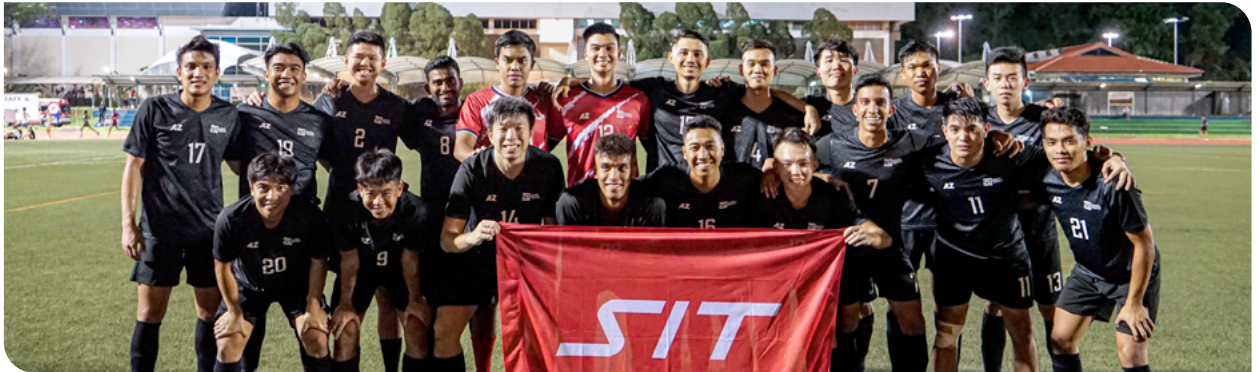
(Top) The SIT Women's Basketball team received the bronze medal. (Bottom) The SIT Men's Football Team won the gold medal.