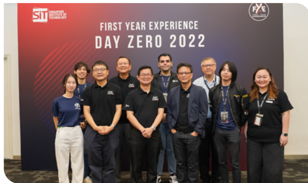
First Year Experience (FYE) is back as a fully physical event after 2 years of being held in an online/hybrid mode.