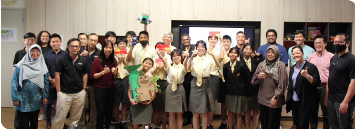
SIT Community Challenge 2022 brought together students and staff from SIT and Greendale Secondary School to promote sustainable living.

secondary 2 students from Greendale and 10 student mentors from SIT's Yes!Program. The students went through prototyping workshops to work on designing or re-designing a product or service that can promote sustainability at home or in their community.