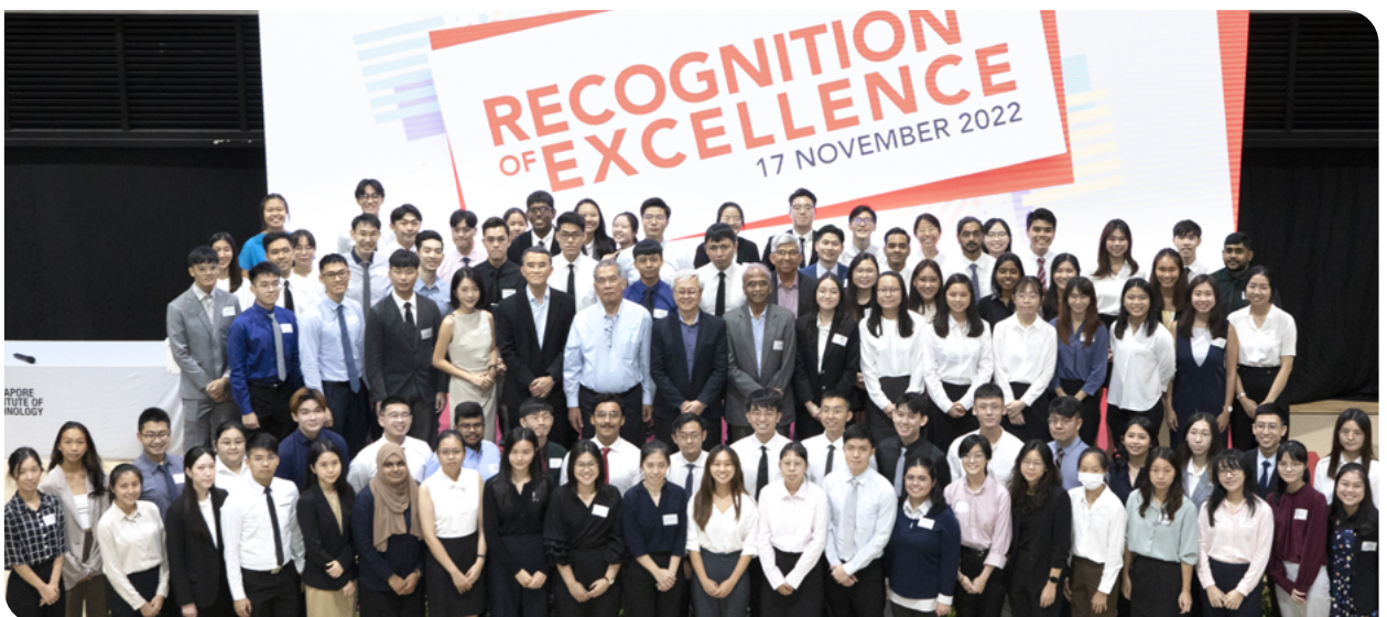
2 key events were held in November 2022 for scholarship and award recipients.