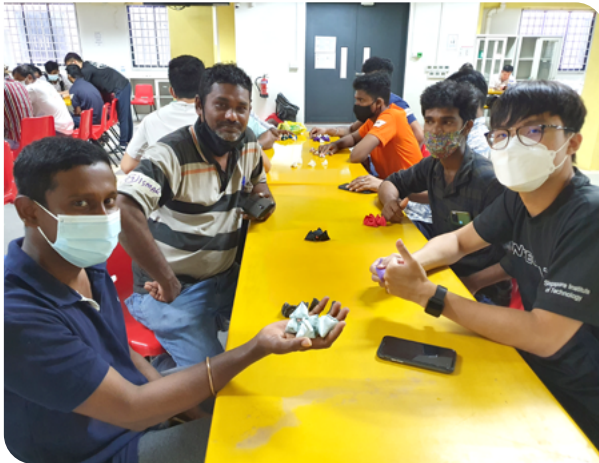
SIT students sharing their cultural game of 5 stones with the migrant brothers.

In addition, SITintegrates partnered with the Ministry of Manpower (MOM) and Westlite Papan Dormitory on outreach programmes for the migrant worker community. In FY2022, more than 700 migrant workers participated in various sports, arts and cultural activities organised by SITizens. SIT was recognised as a valued partner of the Assurance, Care and Engagement (ACE) Group at an MOM Appreciation Lunch for its efforts in integrating migrant workers into the community.