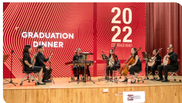
(Left) SIT Chinese Orchestra members with Guest-of-Honour Senior Minister Teo Chee Hean at the Community Chest Fú Dài event. (Right) The SIT Chinese Orchestra performing at the Graduation Dinner 2022.