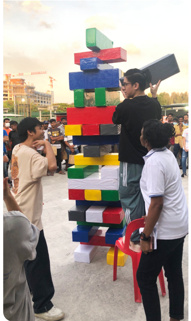
SIT students and migrant friends at Punggol Digital District (PDD) dormitory having a game of jumbo Jenga.