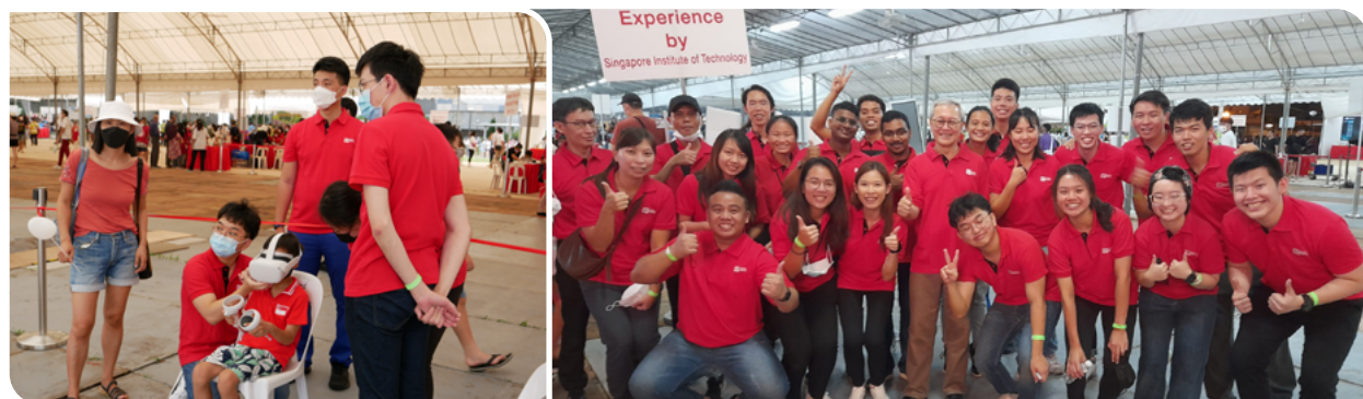
SITizens gave visitors a glimpse of SIT's Punggol Campus via virtual reality.