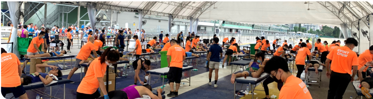
Students from SIT's Physiotherapy programme giving sports massages to participants of the run.

Punggol Field, was attended by 30,000 residents from Punggol, Pasir Ris, Sengkang and Tampines. In an effort to bring healthy living to the community, 80 students from the Physiotherapy degree programme provided complimentary sports massages for participants of the Standard Chartered Run in December 2022.