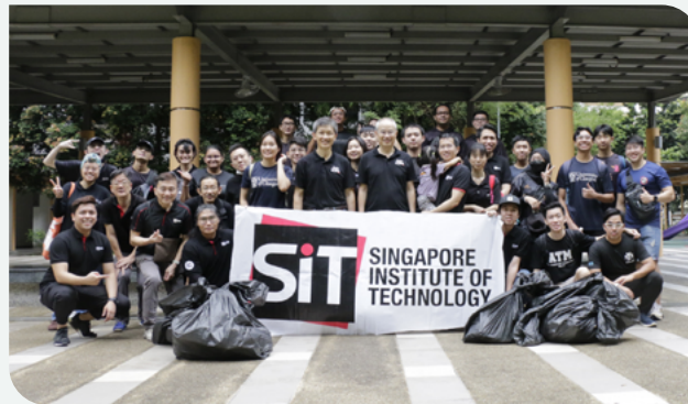
SIT's first SG Clean Day saw participation from staff and students.