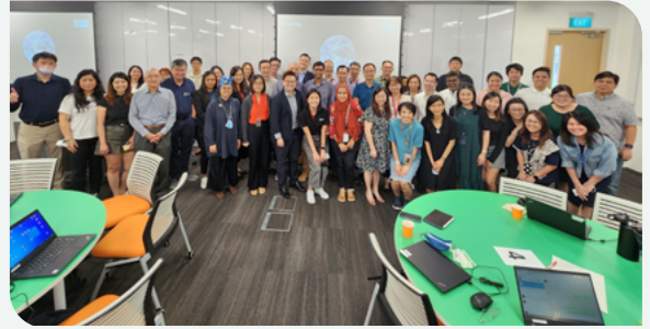
Attendees at the training.

Deloitte conducted the 'Carbon Management and Sustainability Reporting Training' for SIT staff. The workshop aimed to provide an overall understanding of sustainability and carbon management, and helped staff understand the evolving environmental, social and governance (ESG) reporting standards.