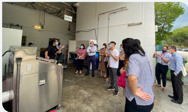
Participants observed how food waste collected from SIT@Dover food outlets is recycled into compost using a food composter.

The 'Getting Ready for the Green Economy' panel discussion addressed sustainability-related challenges faced by industry, and business solutions implemented by organisations. Over 150 staff, students and alumni also learned more about growing job opportunities in sustainability.