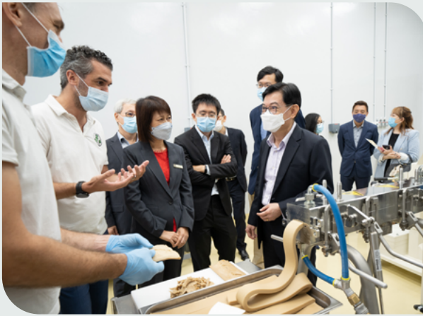
A demonstration of the extrusion machine at the official opening of FoodPlant in April 2022, graced by Deputy Prime Minister and Coordinating Minister for Economic Policies Heng Swee Keat.

with national and economic imperatives, and are bolstered by technology enablers such as AI. By working closely with private and public sector partners, the outcomes from these domains will help to contribute to Singapore's goal of becoming a smart and sustainable nation.