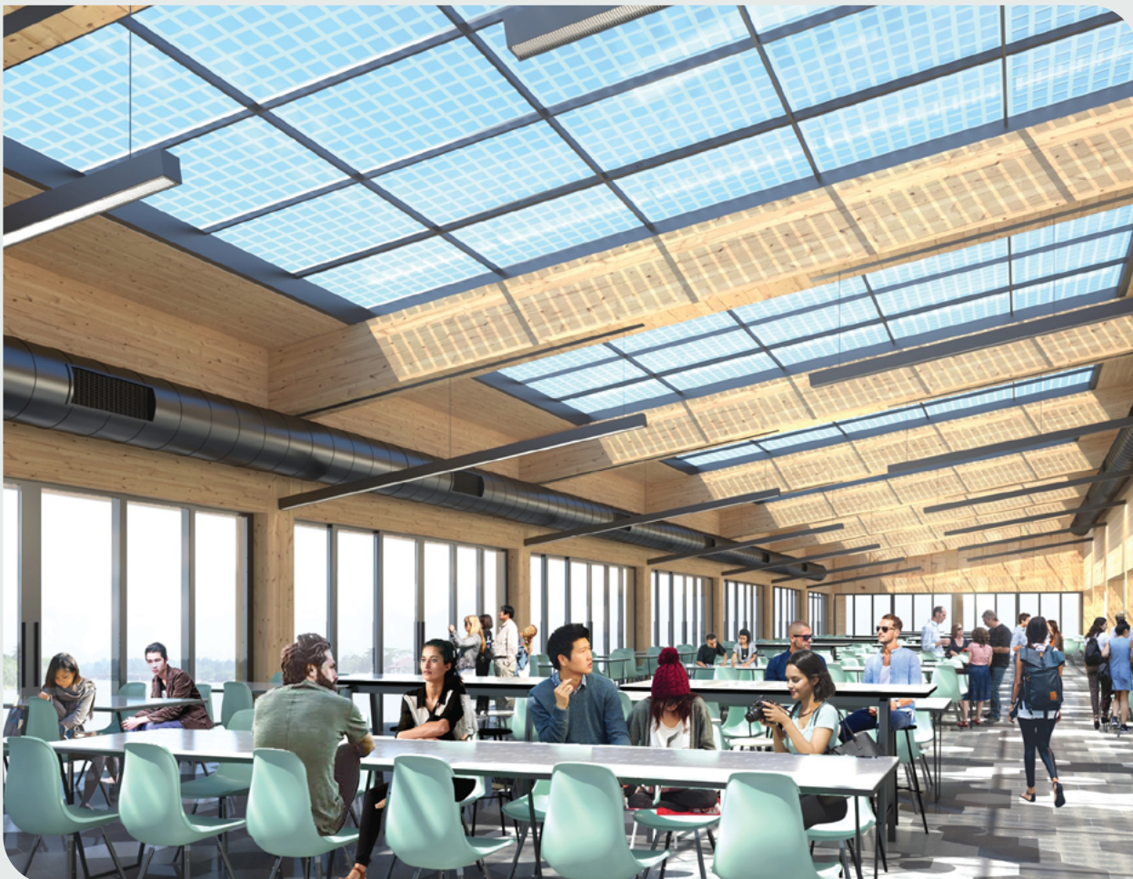
The Block E4 Food Court Building features a Building Integrated Photovoltaic (BIPV) roof that generates renewable energy.

The smart building pools data from various building systems. The first smart solution tracks the building's electrical energy usage to ensure energy consumption does not exceed the SLE threshold. It also includes a calculator to help track and forecast the annual utility budget. The second smart solution automates the building's ventilation and equipment operation based on prevailing weather conditions.