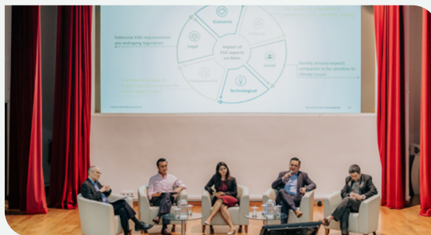
Panellists discussed the impact of sustainability on a company's performance.