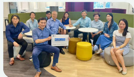
Staff dressed in blue in support of #GoBlue4SG movement.