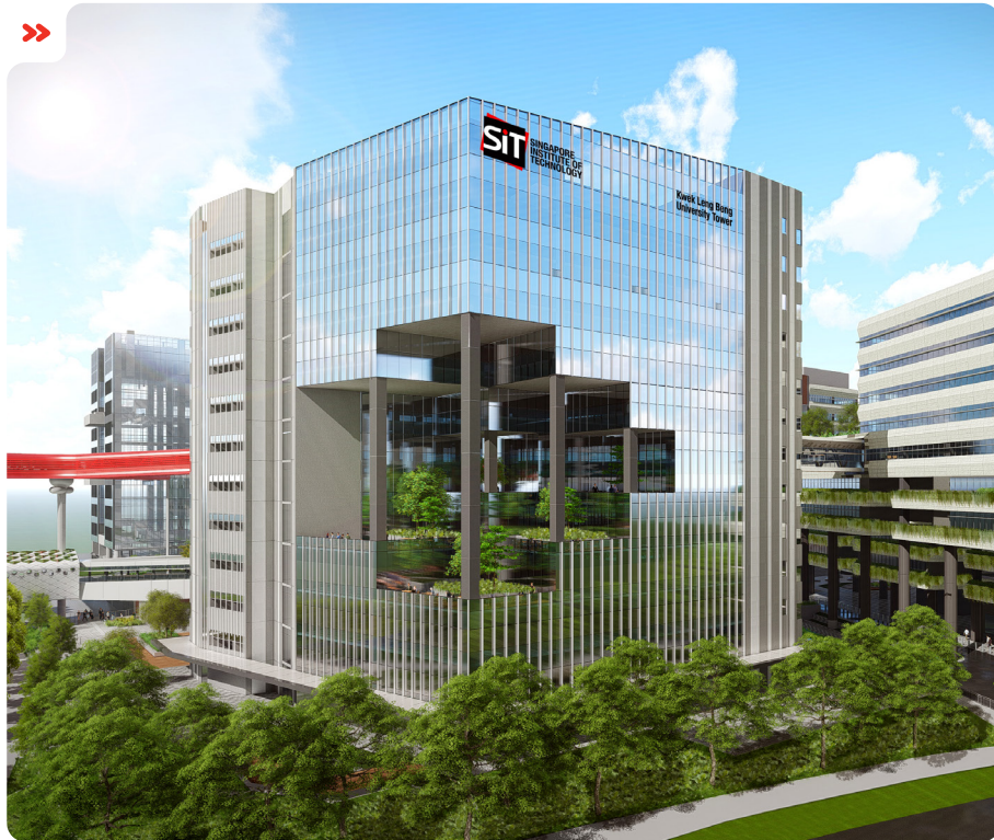
The Kwek Leng Beng University Tower at the SIT Punggol Campus