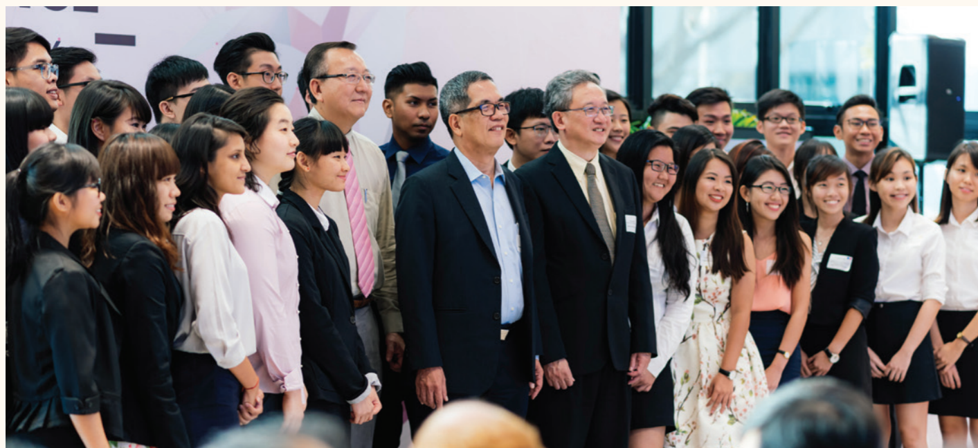
Scholarship recipients at the Recognition of Excellence together with SIT Senior Management.

24 Book Prizes and 3 Outstanding Student Awards were presented at SIT's second Recognition of Excellence, a special reception to celebrate student achievement and the philanthropic support to nurture student excellence; 15 non-bonded scholarships were also awarded to 35 recipients