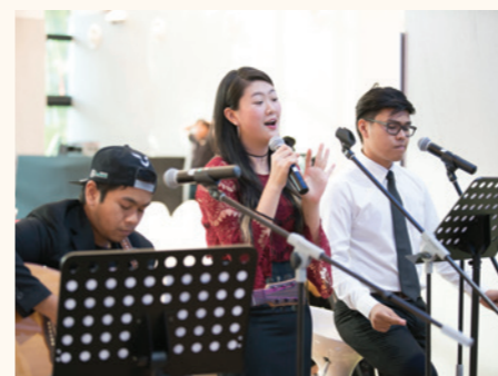
An acoustic performance from Muzeka, SIT's student band, jazzes up the afternoon.