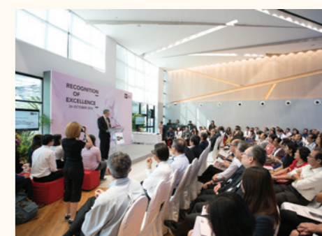
In its second year, the Recognition of Excellence was held at the Student Activities Centre at SIT@Dover campus.