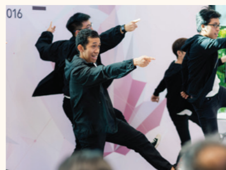
Soul Extreme, SIT's very own hiphop group, giving the afternoon's programme an energetic opening.